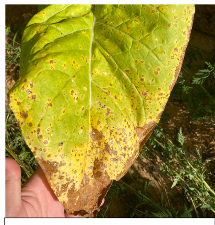
Brown spot and frogeye leaf spot.

I have also seen foliar leaf spots, such as frogeye leaf spot and angular leaf spot, hop onto leaves in fields very quickly, typically following a rain. This is just a warning to keep you eye out for those as we get well into the priming part of the season. Realistically, there is one product that has the ability to slow down the spread of these diseases – Howler. This is an organic product, and is not a silver bullet, but has been shown to reduce the spread of these leaf spot diseases for about 2 weeks after application. If nothing else, it could hold the diseases off until you can get into the field and pull some leaves.