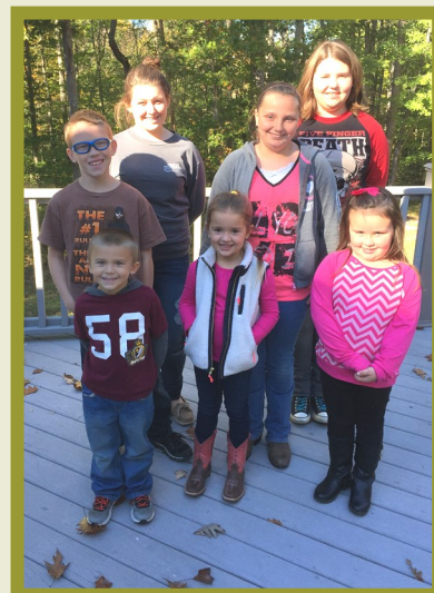
Bushy Fork 4-H Club