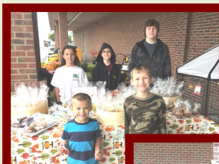
Tractor Supply Volunteers!

clovers! Person County 4-H will receive 60% of those funds, and the remaining 40% will be split between North Carolina 4-H and National 4-H. That means Person County 4-H will receive $339! We will have another Paper Clover Campaign in the spring of 2016, so stay tuned for those details.